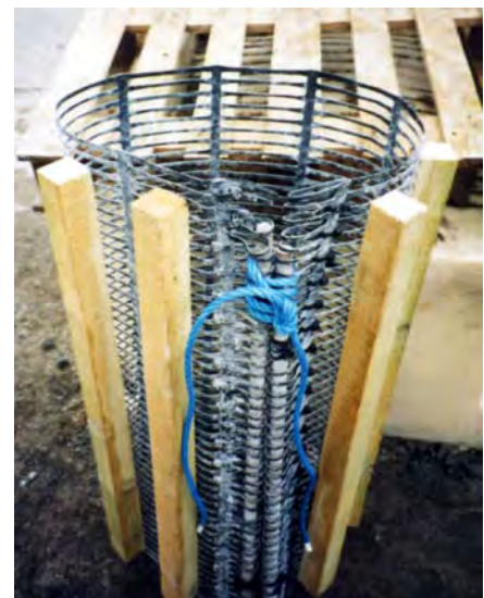
Reinforced Mesh Corset

PVC Spacers are replaced by concrete ones on the upper surface of the raked pile, so as to prevent any possible distortion, and reduction of cover, caused by the weight of concrete.