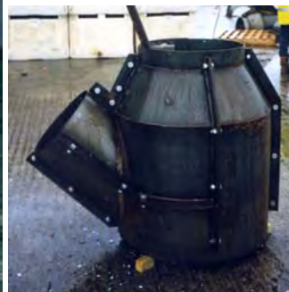
Steelwork Support to Pile Jacket Node

Junctions between piles can also be catered for, using specially designed and fabricated steelwork shutters, as seen left.