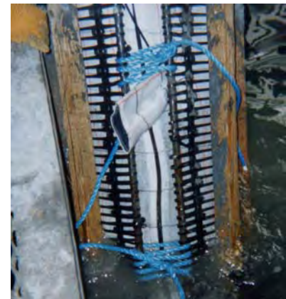
Corset Rope Ties

The Filler sleeves are positioned on the upper surface of the pile, and are filled as normal. The top support detail, shown left, is specially designed to take into account the angle of rake in the pile being protected.