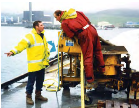
Micro Concrete Mixing and Pumping

The re-useable mesh corset is then fixed which takes the pressure of micro concrete filling, up to heights of 13 m.