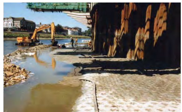
Laid Mattress and Bed Profiling

Against the Sheet Piling, the mattress was profiled to match the sheet piling pans in order to ensure complete scour protection was achieved. Micro concrete was supplied by Ready Mix and pumped down into the Mattress.