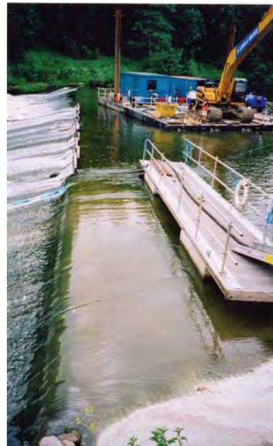
Mattress Construction Progressing Across Weir

After filling, reinforcing bars were pushed into the end of the mattress concrete, to tie into the insitu crest construction,. The bottom part of the mattress was covered with the excavated river gravel to return the upstream slope to the pre-works profile typically 1:4.