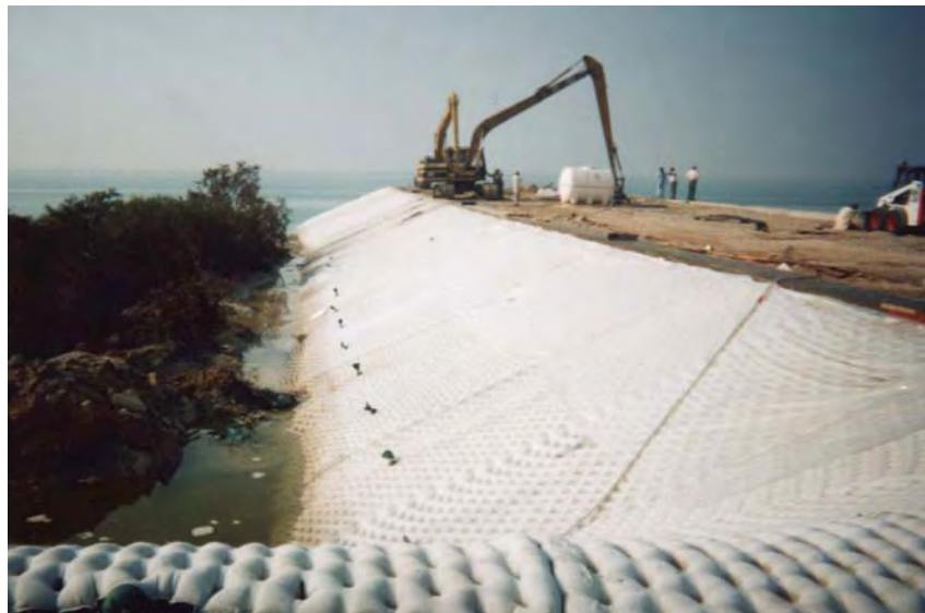
Laid & Filled Mattress Along Embankment

Site installation support was provided by a Proserve Engineer