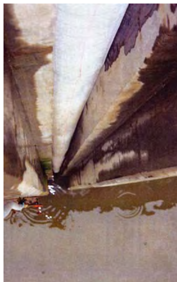
View Down Filled Seal