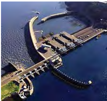
Cardiff Barrage Breakwaters

To the south end of the barrage a protective harbour of 2 curved breakwaters was constructed to protect the locks. The breakwater arms were constructed from a series of massive pre-cast caissons each 17 m high and weighing between 2,500 and 4,500 t. These caissons were individually cast in a dry-dock in Cardiff, and floated into place onto a rock filled trench. Once in location the caissons were filled with sand, and the gaps between them sealed using Fabriform Seals as shown below. The pairs of seals were located in protective recesses and allowed mass concrete filling of the caisson joints