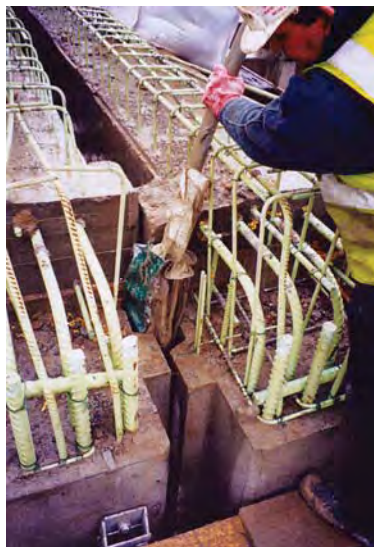
Seal Being Filled

To the south end of the barrage a protective harbour of 2 curved breakwaters was constructed to protect the locks. The breakwater arms were constructed from a series of massive pre-cast caissons each 17 m high and weighing between 2,500 and 4,500 t. These caissons were individually cast in a dry-dock in Cardiff, and floated into place onto a rock filled trench. Once in location the caissons were filled with sand, and the gaps between them sealed using Fabriform Seals as shown below. The pairs of seals were located in protective recesses and allowed mass concrete filling of the caisson joints