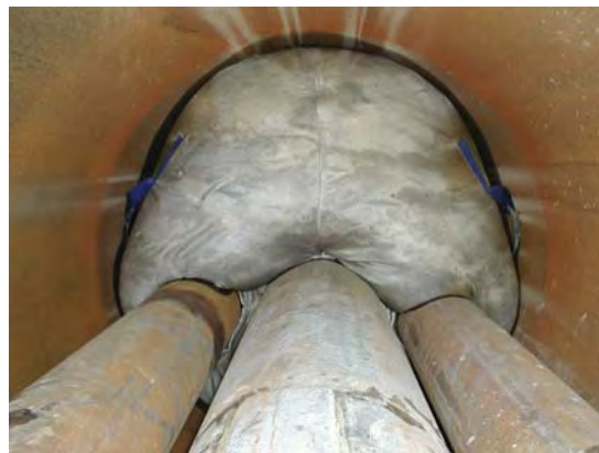
Prototype Test (View Looking Up)