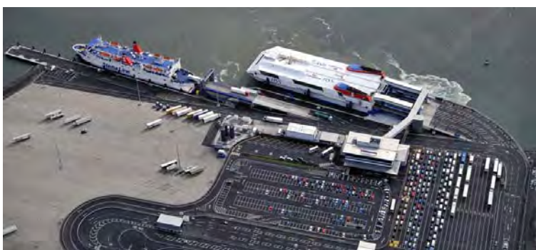
Belfast Harbour, Berth VT4

Mattress installation used a semi automated filling system which increased output and allowed installation between ferry movements to each 10 hour working day period.