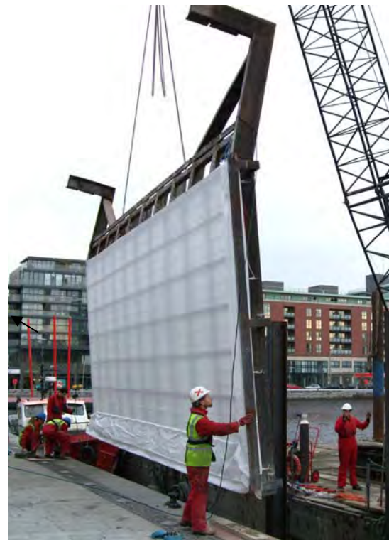
Control Frame Being Craned into Position