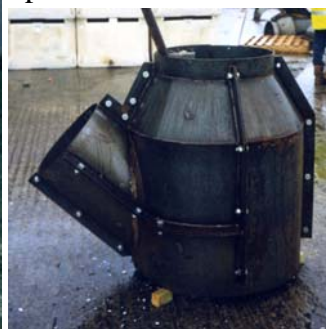
Steelwork Support to Pile Jacket Node

Junctions between piles can also be catered for, using specially designed and fabricated steelwork shutters, as seen left.