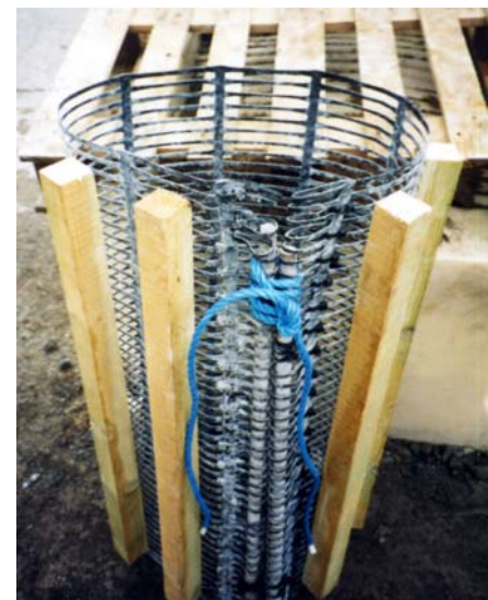
Reinforced Mesh Corset

PVC Spacers are replaced by concrete ones on the upper surface of the raked pile, so as to prevent any possible distortion, and reduction of cover, caused by the weight of concrete.