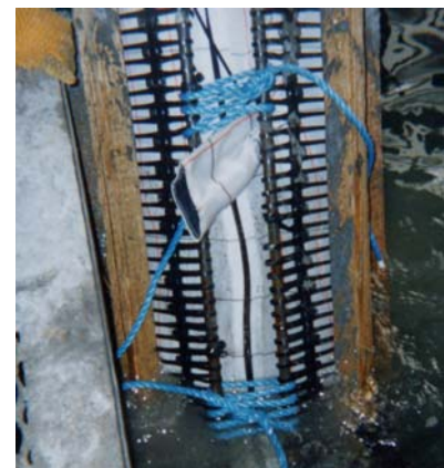
Corset Rope Ties

The Filler sleeves are positioned on the upper surface of the pile, and are filled as normal. The top support detail, shown left, is specially designed to take into account the angle of rake in the pile being protected.